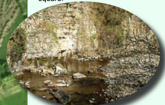
Sheer river cliffs at Peckriding

The road into the village passes the old Methodist chapel and chemist, before opening out into the village square.