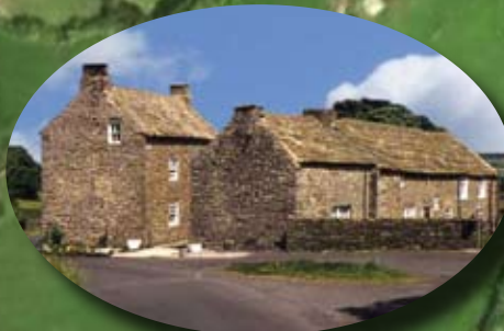
The defensive triangular formation of buildings at Woolley had high status in medieval Allendale