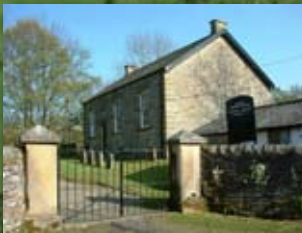
Quakers have been meeting in Allendale since as early as 1663