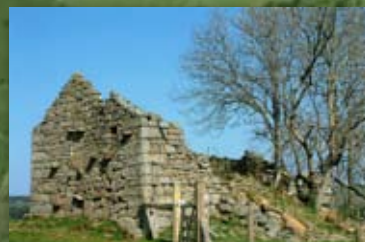
Nine Dargue is the remains of a defensive farmhouse - known as a bastle - and common to Allendale

yard of Peckriding house to meet the Allendale-Allenheads road.