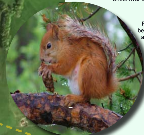
Red squirrels may be seen in the trees alongside the river (Points 8-9)

At Peckriding footbridge, turn left before crossing the river. Refer to Route i6 (Peckriding) , walking it in reverse along the riverside to Woolley Burnfoot and return to Allendale via the Peth.